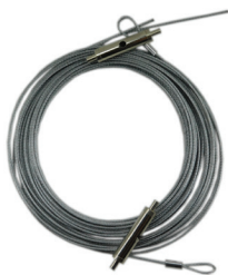
Pair: Grip Lock Y Cables