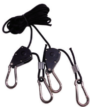
Pair: Grow Light Pulley System